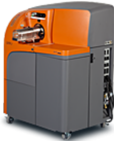
The new CyTOF 2 Mass Cytometer allows analysis of over 40 parameters simultaneously from individual cells.

The Single-Cell Analysis Center (SCAC) at UCSF will provide state-of-the-art instrumentation and expertise for the UCSF community to advance the analysis of gene and protein expression at the single-cell level for both basic and translational research. Fluidigm has developed state-of-the-art technology for single-cell transcriptomics and has recently acquired DVS, the developer of the CyTOF Mass