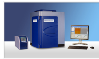
The Biomark offers unparalleled throughput for real-time PCR and digital PCR, integrating thermal cycling and fluorescence detection on integrated fluidic circuits.

and expertise are in one centralized location. This provides an opportunity to combine phenotypic and genomic data allowing more in depth analysis of specific cell populations. With the addition of a CyTOF, it complements the flow cytometer analyzers currently available, but significantly increases the number of parameters able to be