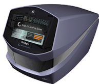
The C1 provides an easy and highly reproducible workflow to process 96 single cells for DNA or RNA analysis.

and expertise are in one centralized location. This provides an opportunity to combine phenotypic and genomic data allowing more in depth analysis of specific cell populations. With the addition of a CyTOF, it complements the flow cytometer analyzers currently available, but significantly increases the number of parameters able to be